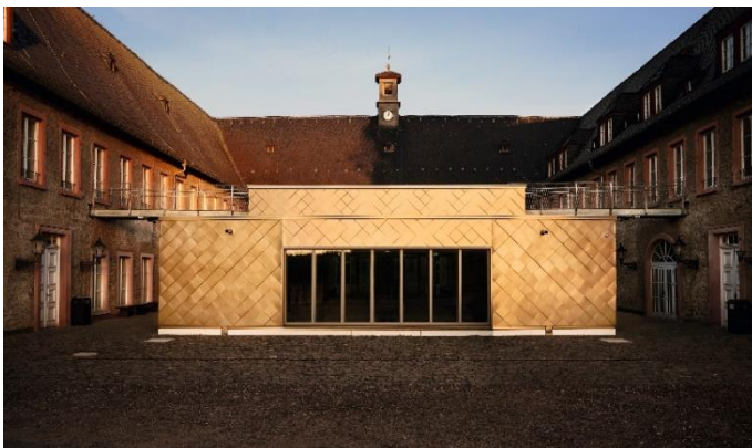
Abb.: New Forum, Campus Schloss