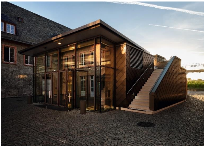
Abb.: New Forum, Campus Schloss