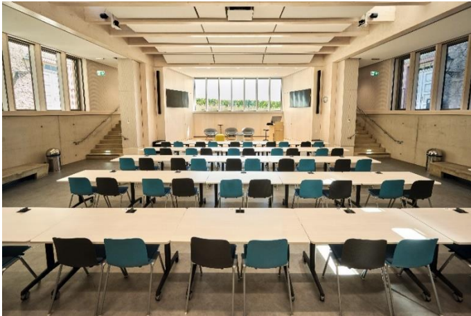
Abb.: New Forum, Campus Schloss