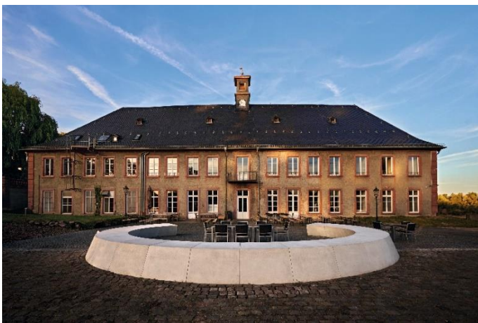
Abb.: main building, Campus Schloss